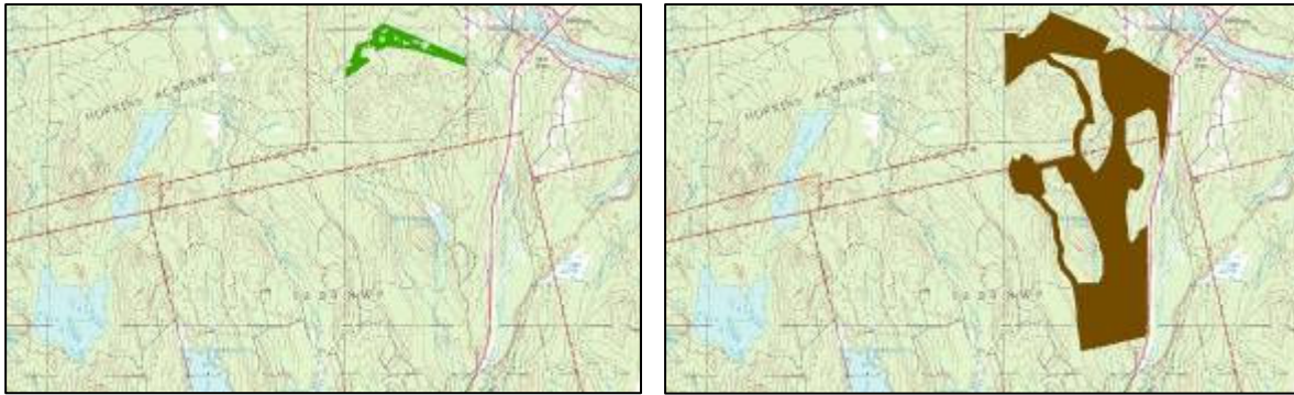
Comparison of a Zoned DWA [P-FW] and a DWA Managed under a Cooperative Agreement